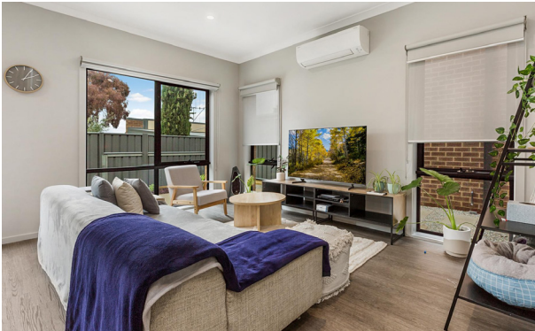
YWCA Bendigo - townhouse living room

The project was fully funded by YWCA who purchased the land on the open market and engaged Melbourne based and renowned architects DKO Architects to design the homes. YWCA commercially tendered the project on a fixed price contract with GJ Gardener the successful builder.