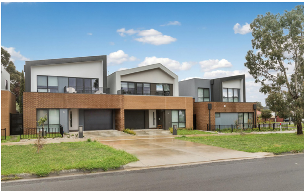
YWCA Bendigo - townhouse exterior

The project was constructed during COVID-19 lockdowns which caused time delays to the program. Despite these challenges, the project remained within budget and was completed to a high standard.