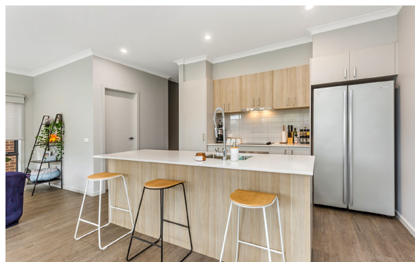
YWCA Bendigo - townhouse kitchen

All homes in the development are six-star energy rated and have several environmentally friendly features that also reduce costs for renters including solar panels, double glazed windows, energy efficient appliances and a water tank. To help renters connect with services, education, employment and community, each townhouse also has NBN connectivity.