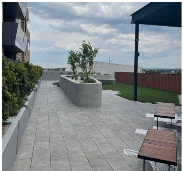
Communal outdoor space

Haven Home Safe is a for-purpose organisation that provides a range of housing solutions and wrap-around supports to help people find and keep a place they can call home. Haven Home Safe operates in 29 local government areas across metropolitan Melbourne and regional Victoria, with offices in Preston, Geelong, Bendigo and Mildura. Haven Home Safe partners with like-minded organisations, developers, investors and all tiers of government to deliver more affordable housing solutions and homelessness supports for Victorians.