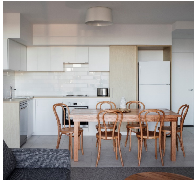
Viv's place interior - apartment kitchen

The building includes 60 apartments ranging in size from studios to 4 bedroom homes, with all studios providing a dual key functionality, for flexibility and ageing in place. Residents can also enjoy the communal kitchen and living spaces, children's play spaces, nature-play courtyard and family and child-specific services on site.