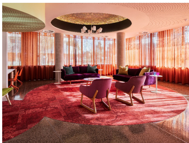
Viv's place interior - parents lounge