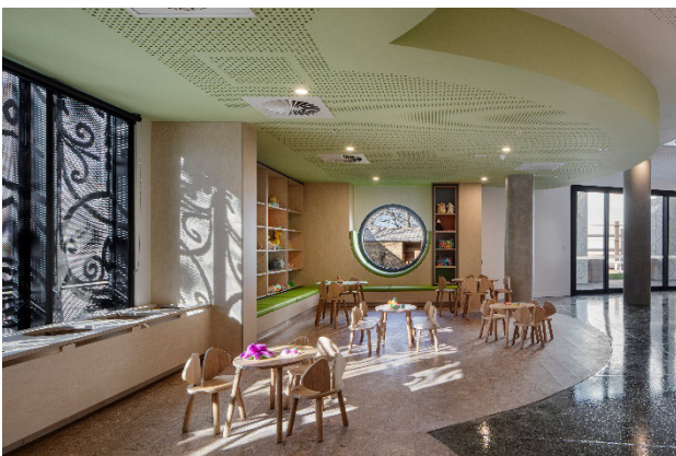
Viv's Place interior - children's play space

Family and domestic violence is the single biggest driver of homelessness in Australia. Viv's Place helps solve this problem by providing safe, purpose built and beautifully designed housing for families, along with on-site support services and 24-7 Resident Engagement concierge. From the first day families move in, they have a safe and permanent home to recover and rebuild, access to the support services they need and the opportunity to participate in the local community.