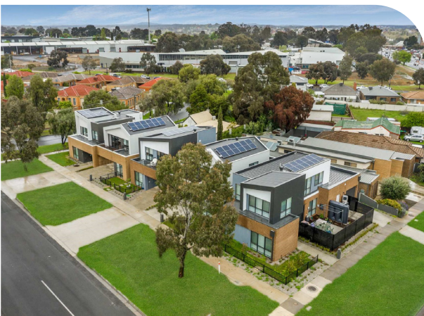
YWCA Bendigo – townhouse exterior

The development contains five two storey, three-bedroom, two and a half bathroom townhouses. Each townhouse has a lock-up garage and a landscaped, fully fenced and secure private open space.