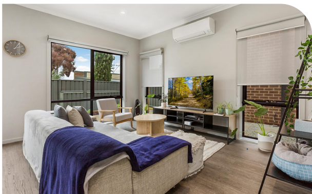
YWCA Bendigo – townhouse living room

The project was constructed during COVID-19 lockdowns which caused time delays to the program. Despite these challenges, the project remained within budget and was completed to a high standard.