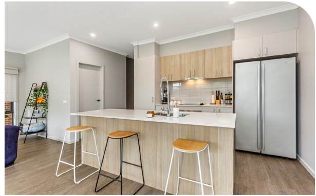
YWCA Bendigo – townhouse kitchen

All homes in the development are six-star energy rated and have several environmentally friendly features that also reduce costs for renters including solar panels, double glazed windows, energy efficient appliances and a water tank. To help renters connect with services, education, employment and community, each townhouse also has NBN connectivity.