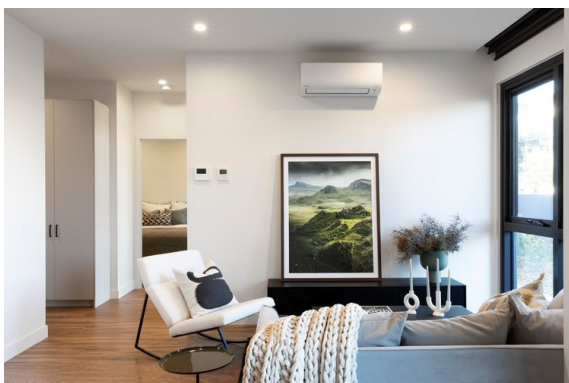
Marlborough St Balaclava – apartment interior

HousingFirst is an award-winning, regulated, not-for-profit organisation providing social housing to over 2000 people across Melbourne. Born from a community campaign in the 1980s to stem the loss of affordable housing within the City of Port Phillip, HousingFirst has since expanded to provide social housing in fifteen additional local government areas across Melbourne. In all developments HousingFirst strives to create a sense of place that residents can call home, build relationships with the surrounding community, and link with the full range of local services and opportunities to enable residents to thrive.