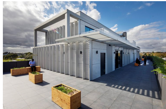
Marlborough St, Balaclava – community terrace

“We want to foster a community with strong social connections, where people feel safer and welcome and have access to affordable housing and the information and services they need to support their health and wellbeing.” – City of Port Phillip