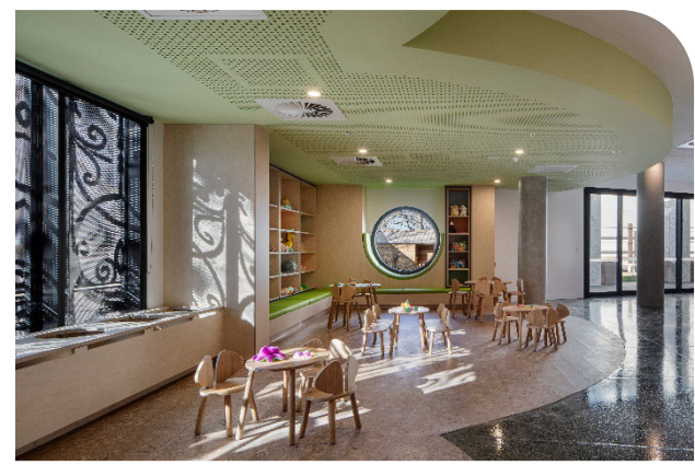
Viv's Place interior – children's play space

From the first day families move in, they have a safe and permanent home to recover and rebuild, access to the support services they need and the opportunity to participate in the local community.